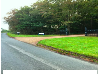
Guest Entrance & Luggage Drop off (via the front door)